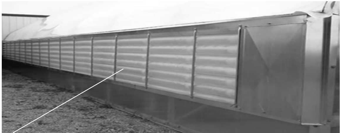
Inflated 6" diameter Poly-Vent tubes. Two stage vent with both stages inflated.